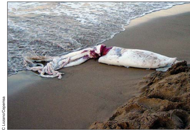
Figure 1. A giant squid ( Architeuthis dux ) carcass on a beach in Spain.

exploitation) in the marine environment (Marine Mammal Commission 2007). In addition, the potential increase in ambient sound levels will not affect all areas equally, but will differentially impact specific regions where offshore activity is high (eg some of the Exclusive Economic Zones; see OSPAR Commission 2009). Potential effects might not be proportionate to noise pollution levels due to variation in sound propagation and, most importantly, the distribution of marine organisms that are sensitive to sound.