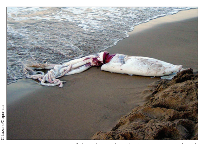
Figure 1. A giant squid (Architeuthis dux) carcass on a beach in Spain.

exploitation) in the marine environment (Marine Mammal Commission 2007). In addition, the potential increase in ambient sound levels will not affect all areas equally, but will differentially impact specific regions where offshore activity is high (eg some of the Exclusive Economic Zones; see OSPAR Commission 2009). Potential effects might not be proportionate to noise pollution levels due to variation in sound propagation and, most importantly, the distribution of marine organisms that are sensitive to sound.